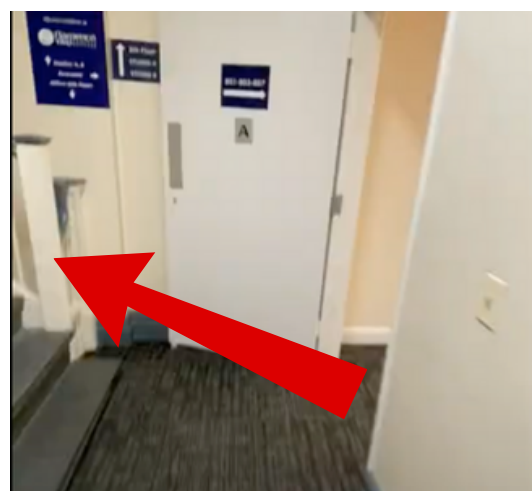
Stairs to the 8th floor from elevator